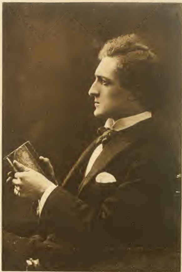
Richard Le Gallienne